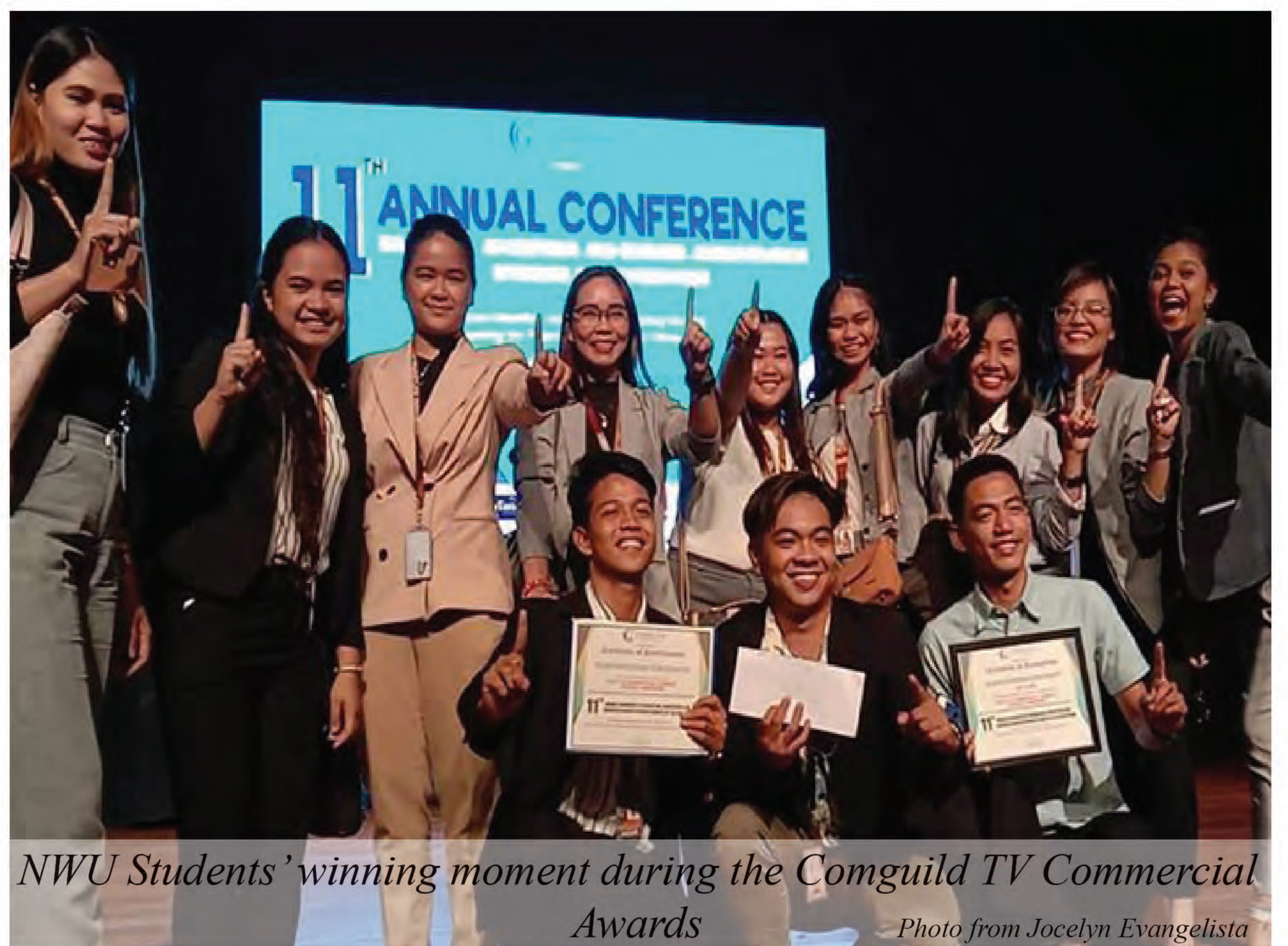
NWU Students' winning moment during the Comguild TV Commercial Awards

Timpuyog Program is NWU's advocacy of extending assistance to the victims of calamities or disasters: Timpuyog. It started after the onslaught of Ondoy in September 2009 as a way of providing assistance to the victims of the flooding in Metro Manila. The said advocacy was also initiated after the devastating Typhoon Yolanda that hit Visayas in November 2013.