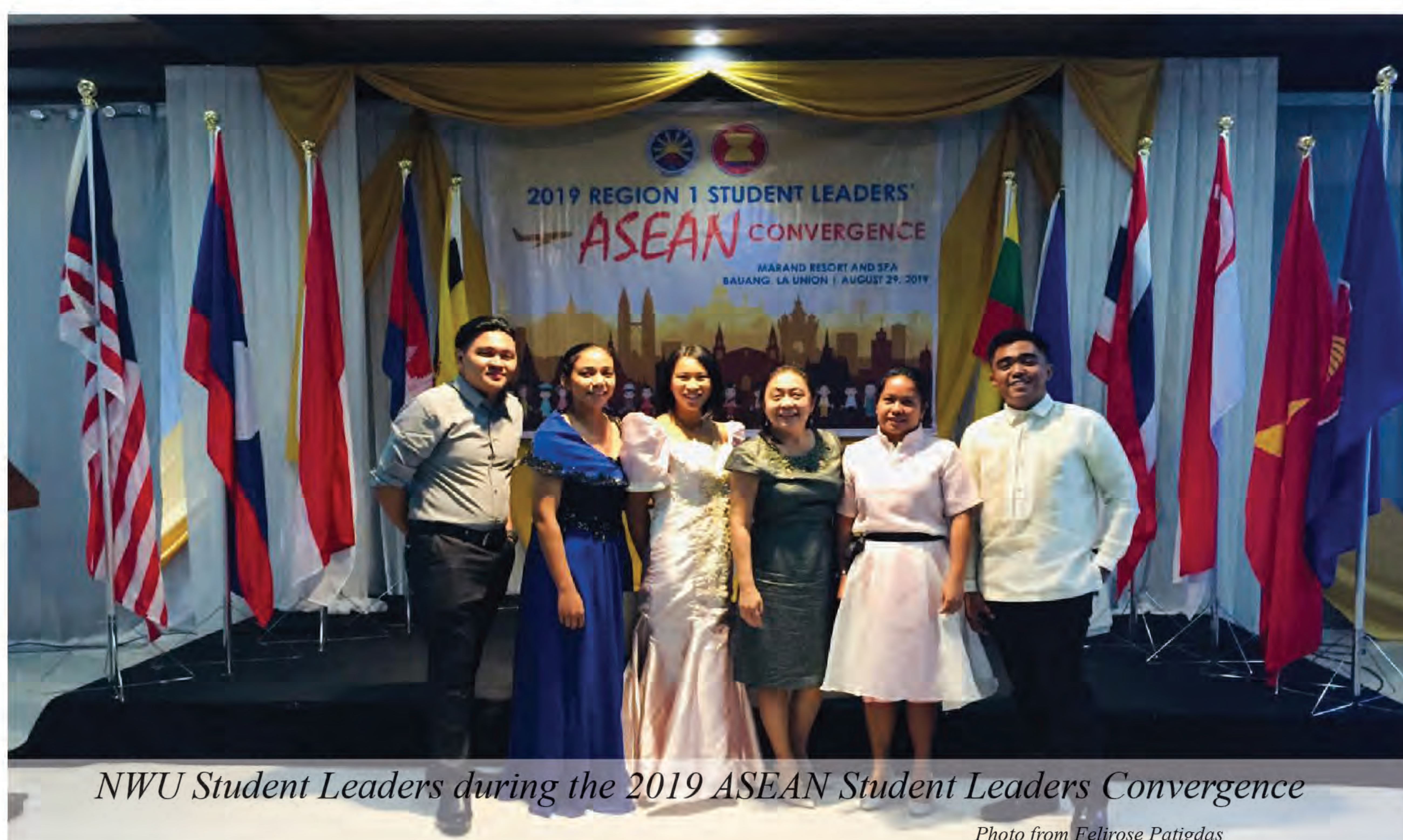
NWU Student Leaders during the 2019 ASEAN Student Leaders Convergence

The participants shared what they have learned during the event through a re-echo during the Leadership Encampment 2019.