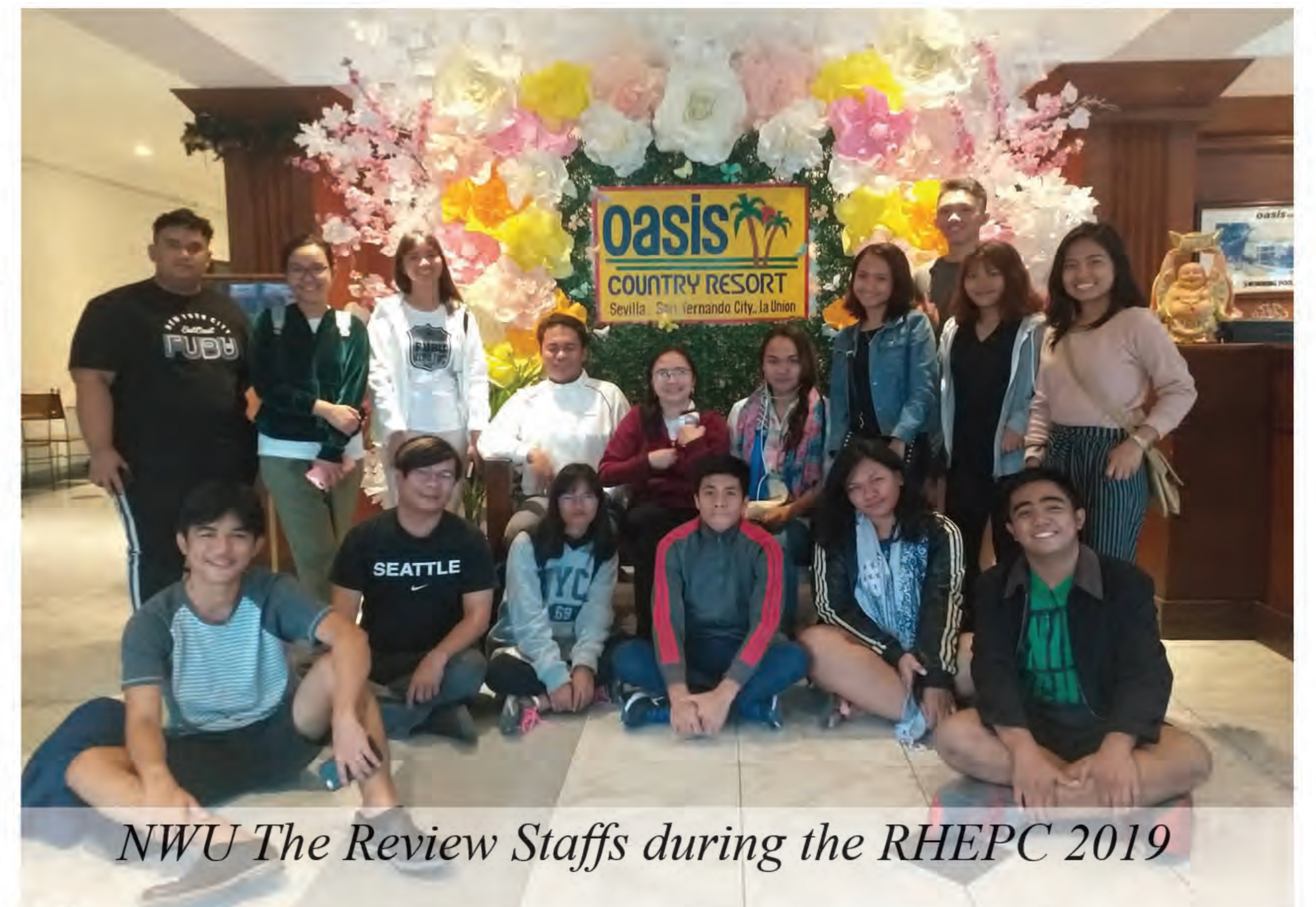
NWU The Review Staffs during the RHEPC 2019