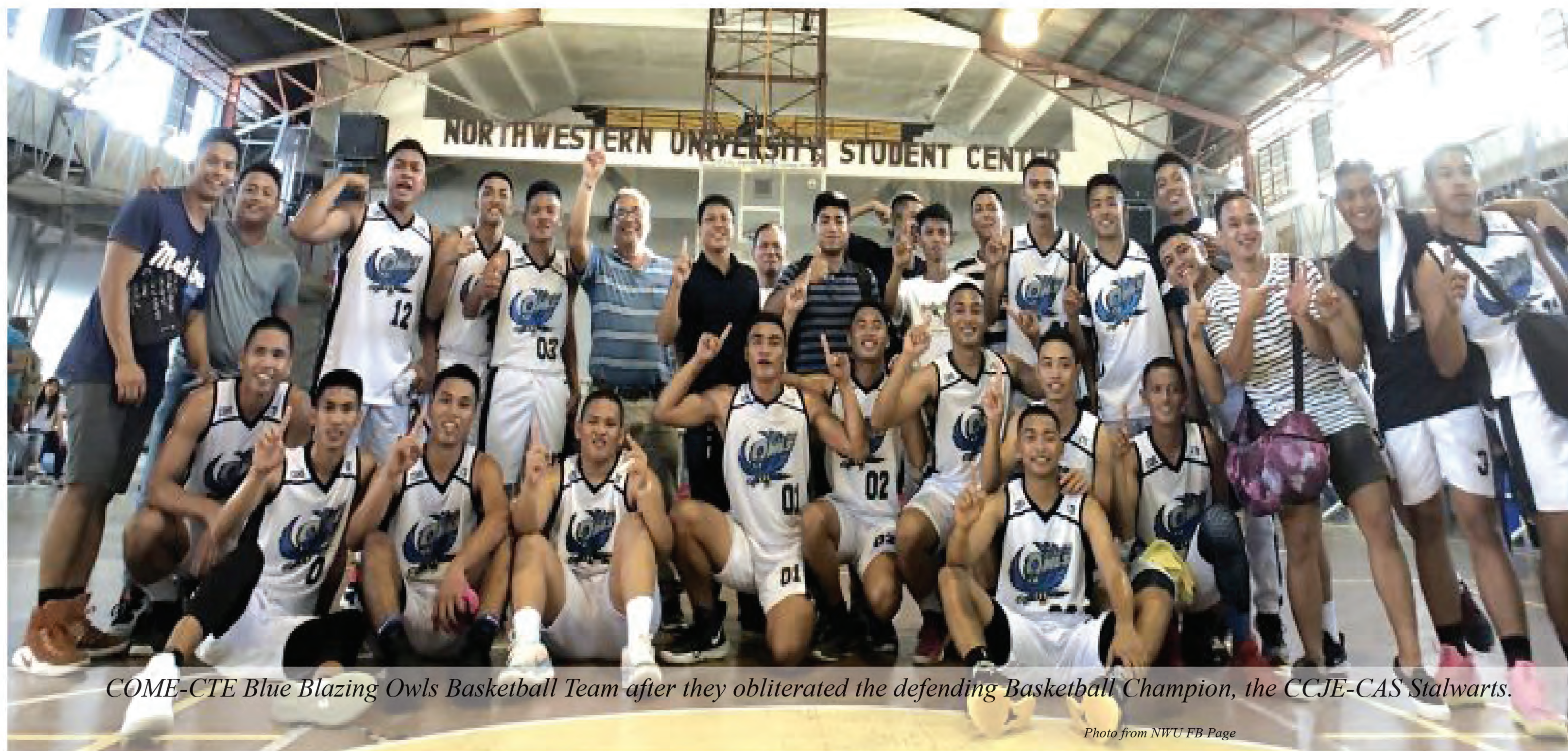
COME-CTE Blue Blazing Owls Basketball Team after they obliterated the defending Basketball Champion, the CCJE-CAS Stalwarts.